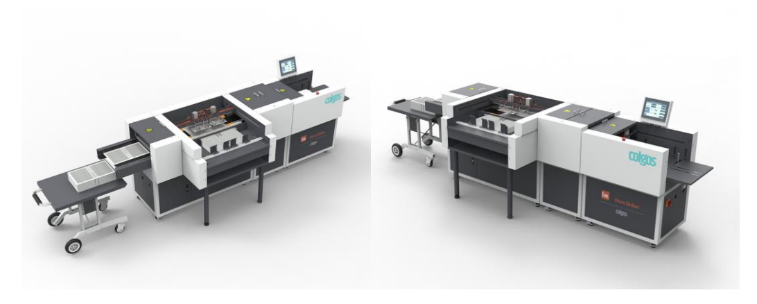
The one of the Colgos product family for hardcover production How does Case Maker Works